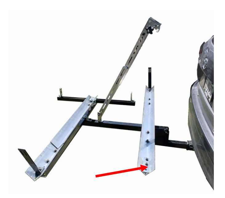
This what the Bike Tab should like after it is bent

Slide the Bike Tab under the Flat Bracket where the arrow is pointing and bend the Bike Tab as the second picture below shows.